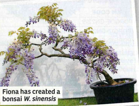
Fiona has created a bonsai W. sinensis