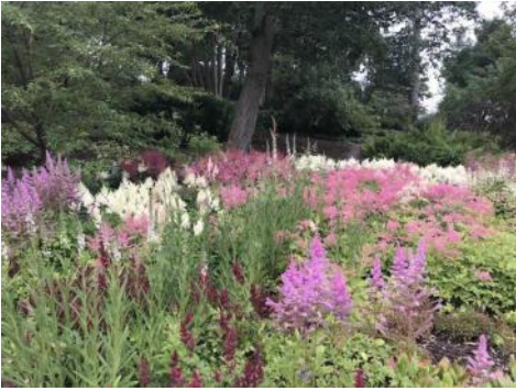
Astilbe x arendsii at RHS Wisley