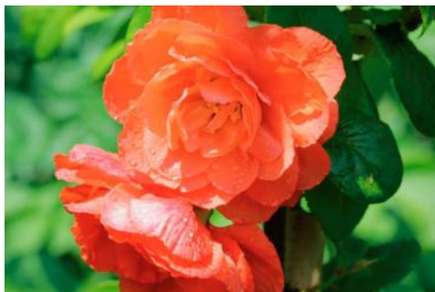
Chaenomeles 'Mango Storm'