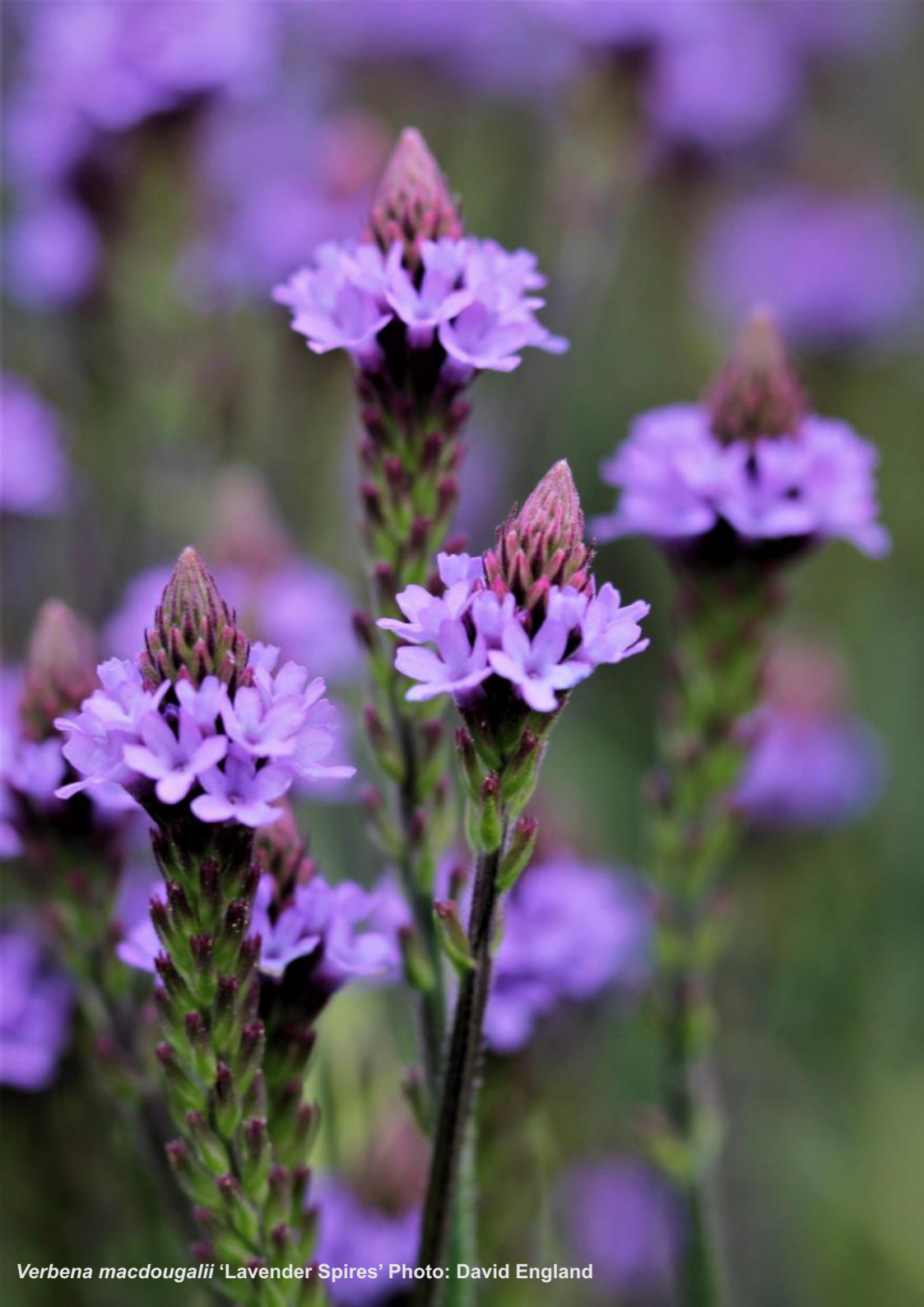
Verbena macdougalii 'Lavender Spires'