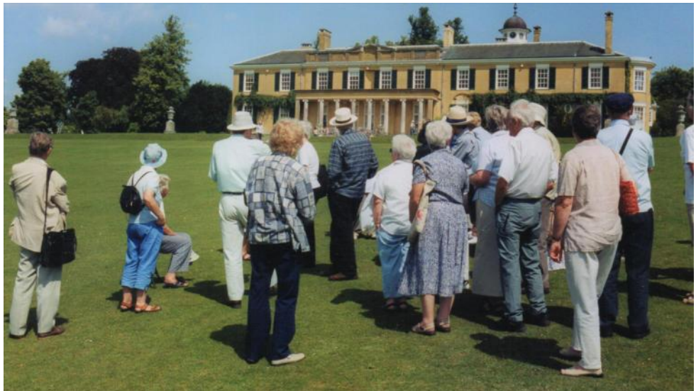
Visit to Polesden Lacey 24 July 2004