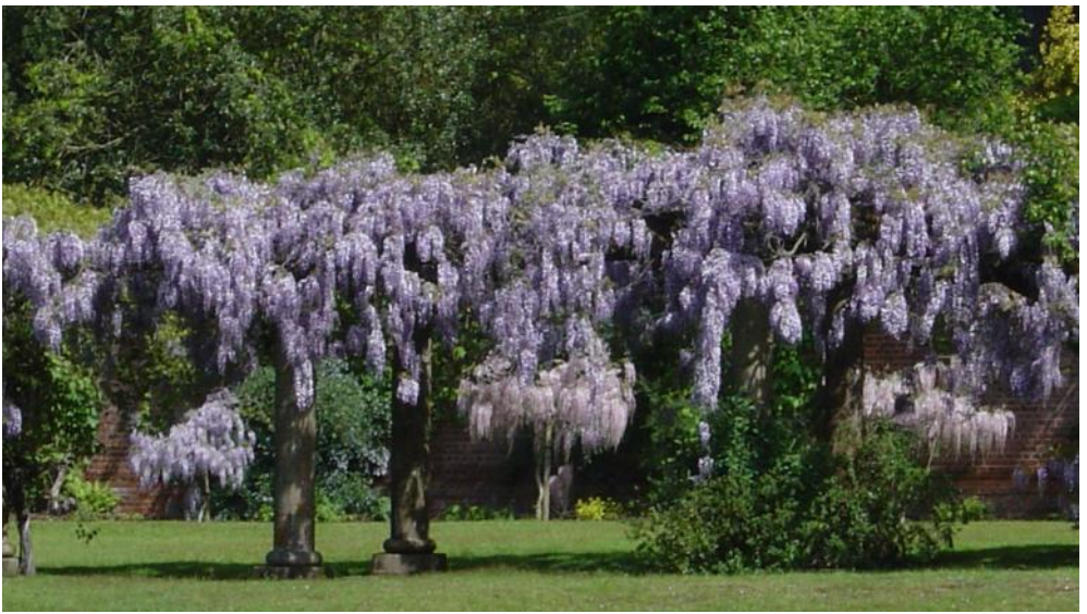
Above; The Pergola in 2006 and below; as it looks in 2020 after last winter's major prune.