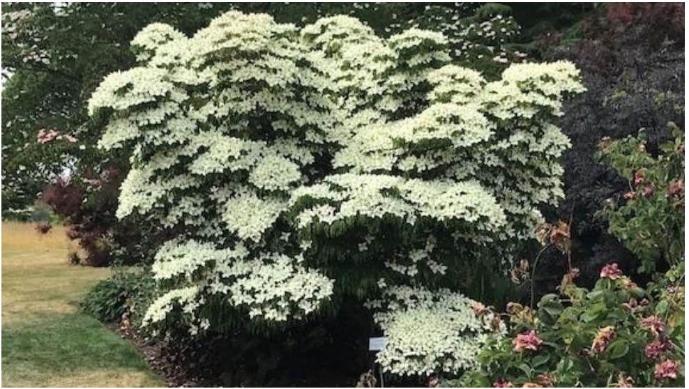
Above: Cornus kousa at RHS Wisley