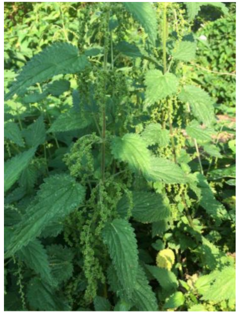
Above: Urtica dioica (Stinging Nettle)

If there's been anything positive about the lockdown, it is that people may be thinking more about what they eat and even thinking about growing their own.