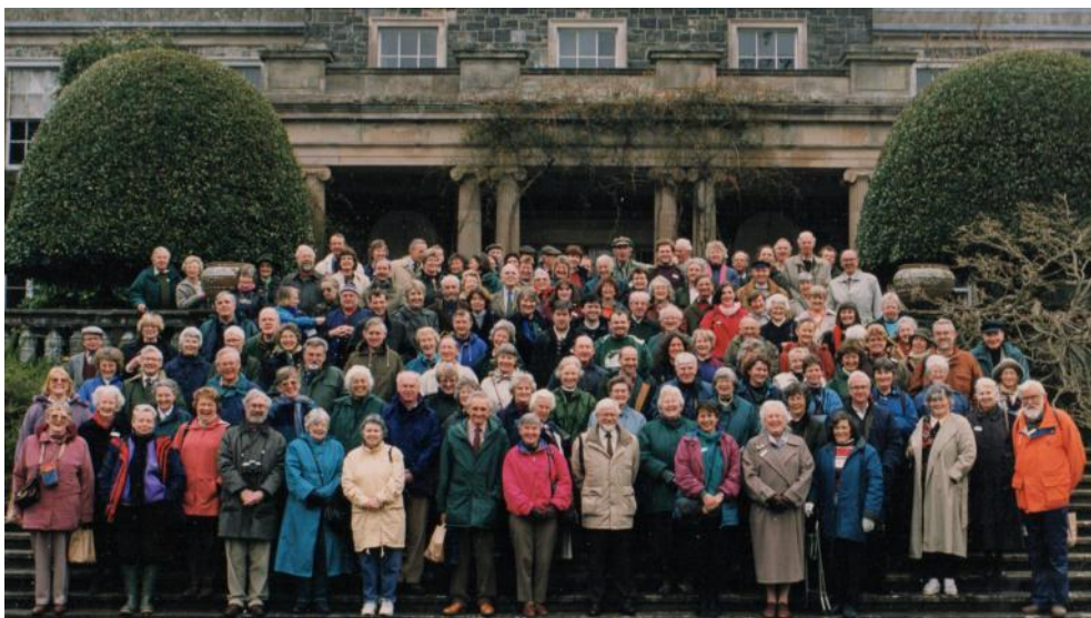
Visit to Mount Stewart as part of the NCCPG Annual General Meeting and Conference, Belfast, 1996