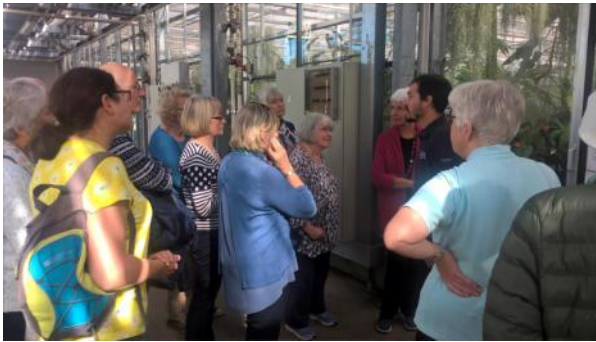
Waiting to view the Maxillaria at RBG Kew October '19