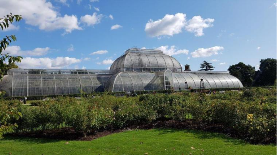
The Palm House at Royal Botanic Gardens (RBG) Kew