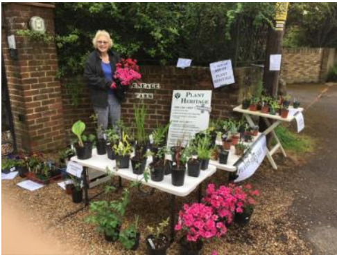
Wendy's Kerbside Plant Sale