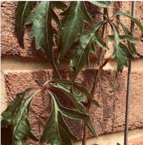
Above and right: Lagerstroemia at RHS Wisley