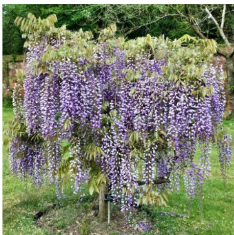
Wisteria floribunda 'Nana Richins Purple'

There are now a few gardeners onsite to carry out pruning, essential at least once a year since Wisteria flower on spurs formed once its enormous potential for many metres of stem growth is hindered. During lockdown, I managed to visit and found the plants along the pergola flowering as best they