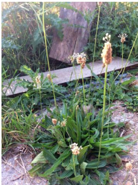
Plantago lanceolata & P. major

We also learned to make simple salves and potions for our own use, gathering plants from the