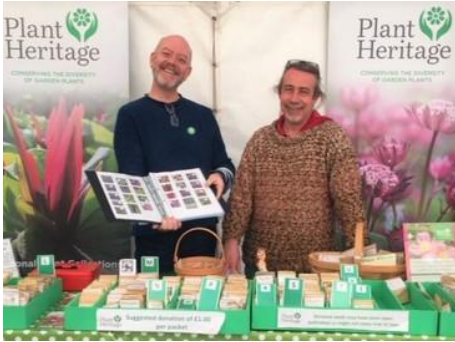
Selling Seeds at RHS Wisley October '19