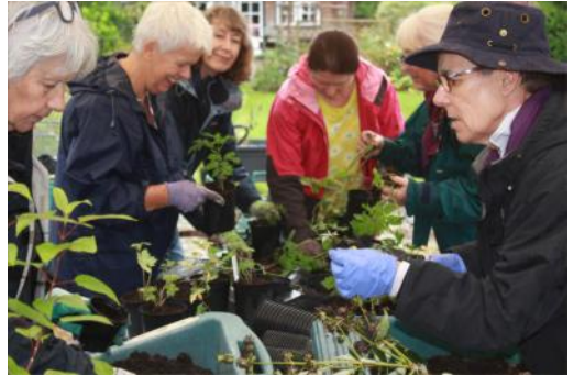
Propagation Workshop at Wendy's October '19