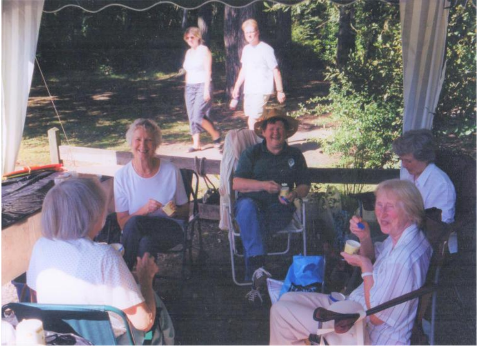
Plant Fair (or is it Ice Cream Fair?) RHS Wisley 4 September 2004