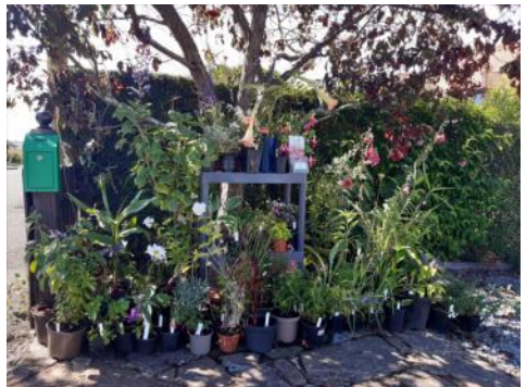
David's Kerbside Plant Sale