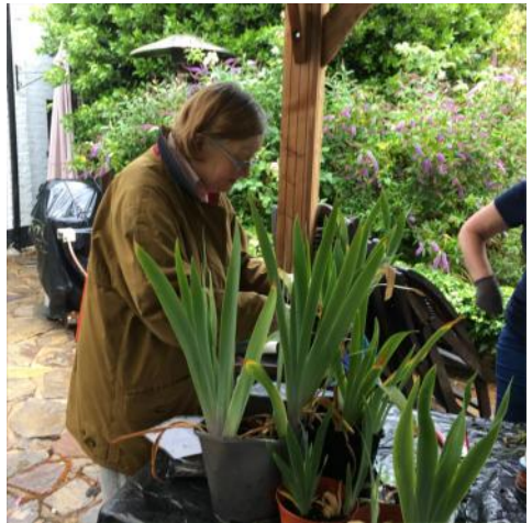
Propagation Workshop at Wendy's July '20