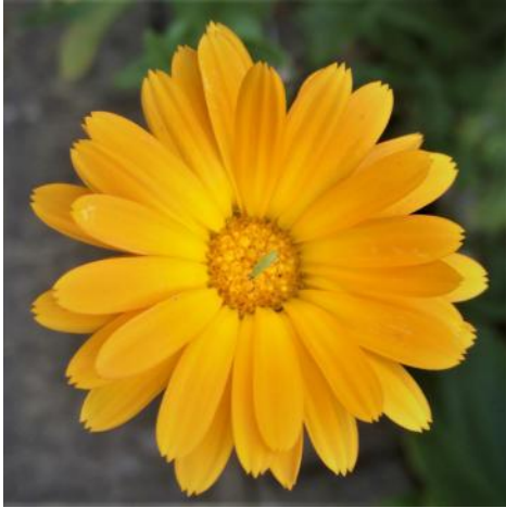
Calendula officinalis (Pot Marigold)