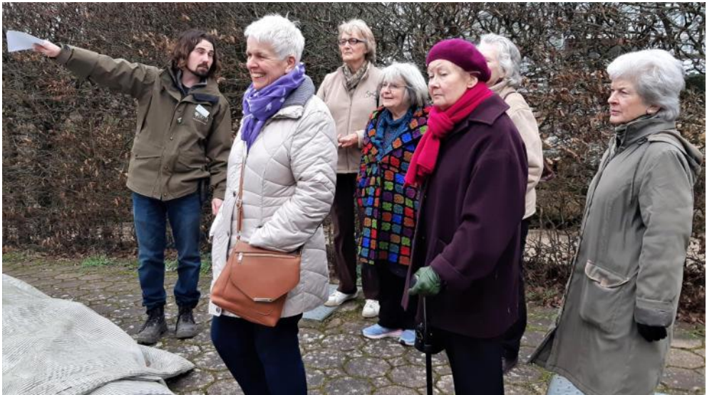
Viewing the National Collection of Galanthus at RHS Wisley February 2020