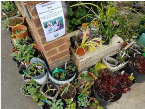
Claire's Kerbside Plant Sale