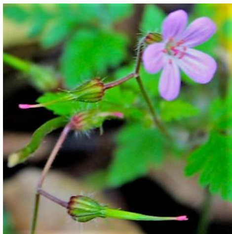
Geranium robertianum (Herb Robert)

garden and grinding them with a pestle and mortar.