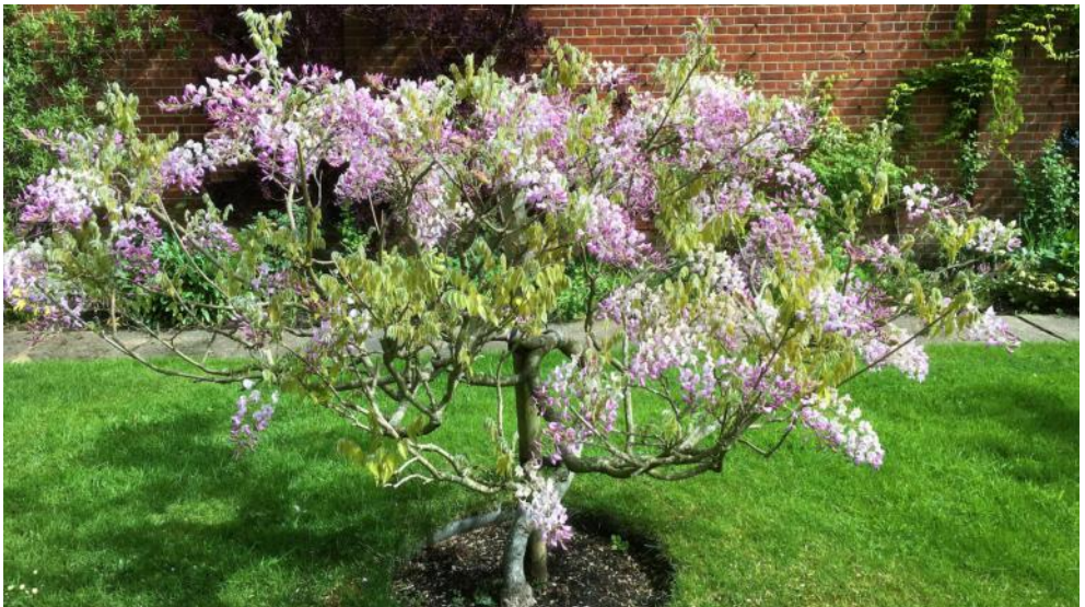
Wisteria brachbotrys 'Showa-beni'