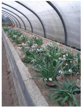
Viewing the National Collection of Galanthus at RHS Wisley February 2020