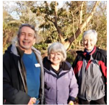
Epimedium thinning at RHS Wisley January 2020