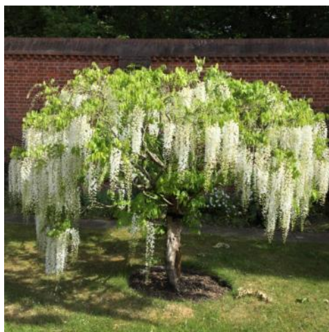
Wisteria floribunda f. alba 'Shiro-Noda'