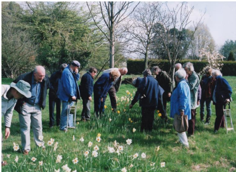
Surrey Group members studying Narcissi , 17 April 2004