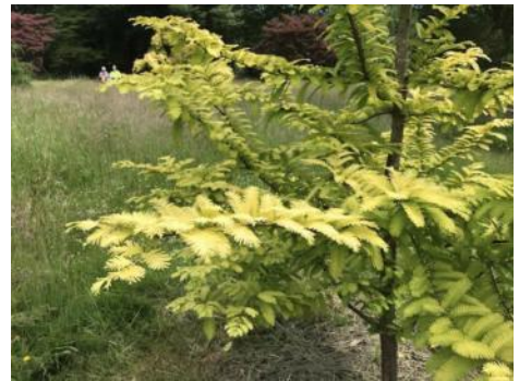
Metasequoia glyptostroboides 'Golden Dawn'.

Wisley holds some of the first species plantings of Metasequoia glyptostroboides in the country with plants grown from seed collected on the 1948 expedition to Szechuan and Hupeh Province, Shui-sa-pa valley. The Liriodendron collection contains several large specimens and Champion Trees, with recent additions of rarer cultivars in the last three years.