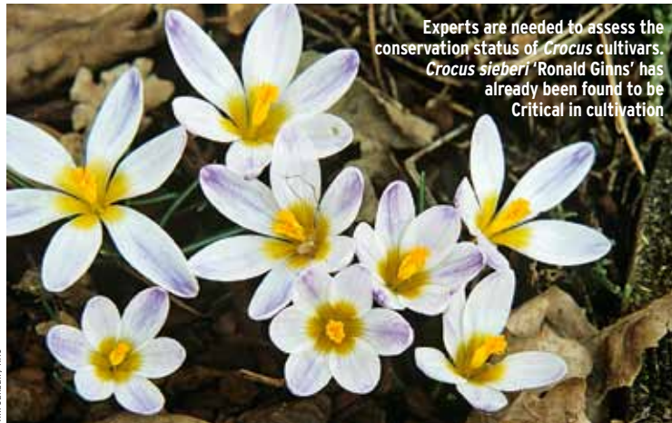
Experts are needed to assess the conservation status of Crocus cultivars. Crocus sieberi 'Ronald Ginns' has already been found to be Critical in cultivation