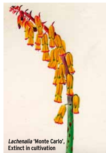
Lachenalia 'Monte Carlo', Extinct in cultivation

Inspired by the International Union for Conservation of Nature's assessment framework for conservation of wild species, we have developed a