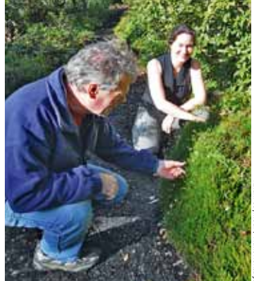
Kalani Seymour / Plant Heritage

Threatened Plants Project pages on the Plant Heritage website: www.plantheritage.org.uk/TPP.aspx