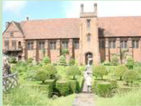
Garden visits – Hatfield House June