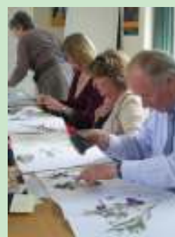
Herbarium Workshop for Collection Holders