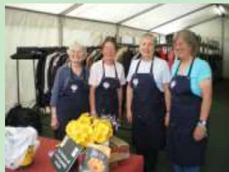
Volunteering at shows – Chelsea cloakroom