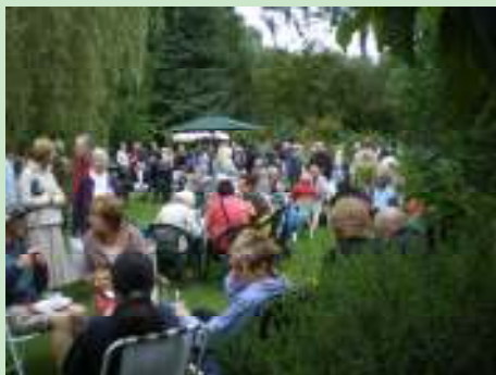
Collection Holder Open Days – National Collections of Araliaceae, Eucalyptus and Podocarpaceae, Hampshire September