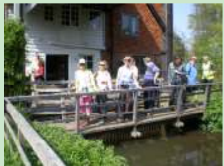
Special events – Sponsored Walk April