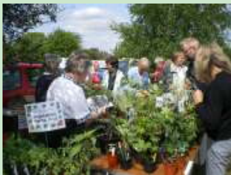
Plant Fairs - Surrey Spring Plant Fair

To remind you, activities in 2009 included: