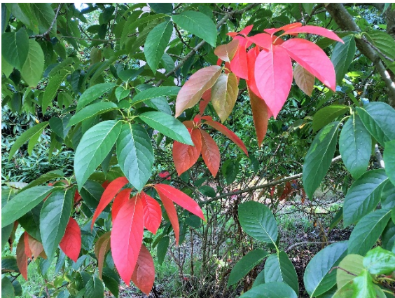
Nyssa sinensis Nymans form: early autumn colour