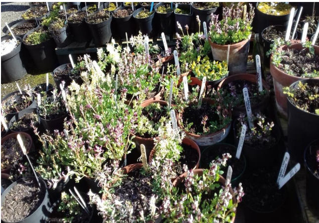
Part of the Corydalis National Collection