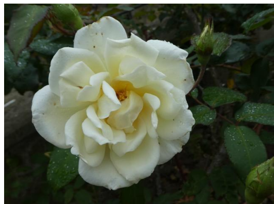
Rosa 'Pax' bred in 1918