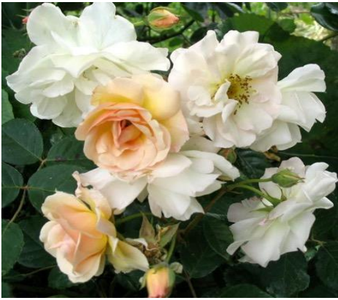
Rosa 'Penelope' bred in 1924