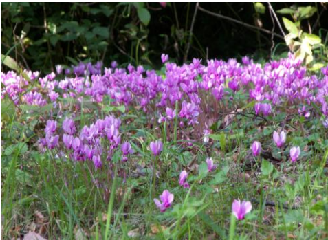
Cyclamen hederifolium

We've added to the groups of Cyclamen hederifolium over the years and they've been particularly good this year, flowering for a long period. They seem particularly happy at the top of the rockery and under the large cedar tree where they are seeding themselves. They are an ideal plant if you have a dry shady area where not much else will grow. Now is the time to get on with bulb planting; we have dug up many 'Seagull' daffodils from one of the woods not visited by the public and added them to a new area where they will be planted under groups of different Malus along with drifts of Narcissus poeticus ; hopefully over time these will give us a good show in the spring. Tulips are also added to the meadows now. They don't