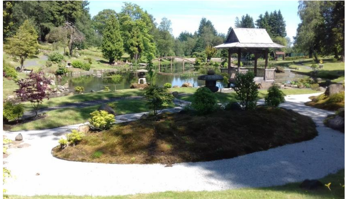
Japanese Garden, Cowden Castle

Wherever we went in Scotland, the good weather brought families out to picnic on the lawns and grassy areas (especially under tree canopy) and this in itself brought the properties to life. The castles were definitely of an era but the grounds full of people were very much of today. I think we chose the hottest day of the Scottish summer to visit Scone Palace. It was officially a visit to update Demeter for Brian Cunningham, the Head Gardener, but we took advantage of the occasion and explored the castle and grounds as well. Much of the park is woodland, so it was welcome shade.