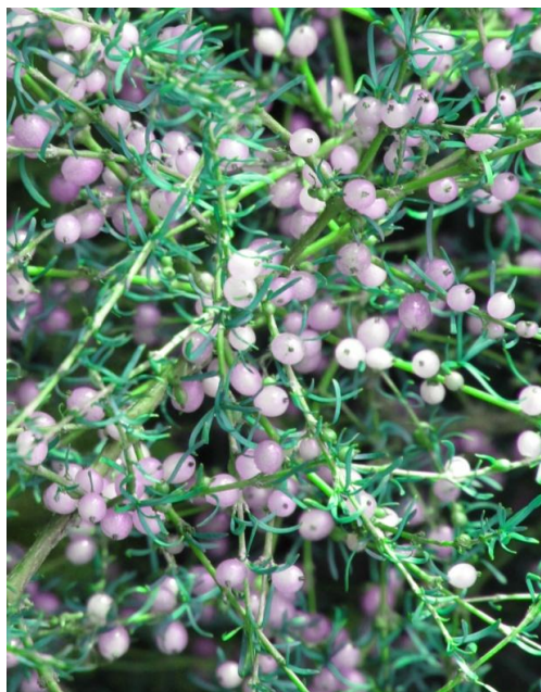
Coprosma rugosa

Welcome to the new season; we need to get through winter, but it helps to think about spring and to plan garden visits in 2019. It's hard to resist visiting botanic gardens, which suggests that we have certain expectations of gardens so designated. Their role is neatly summed up by the International Agenda for Botanic Gardens in Conservation as "institutions holding documented collections of living plants for the purposes of scientific research, conservation, display and education", a statement which sits well with Plant Heritage objectives, and also, hopefully, guarantees a garden at its peak.