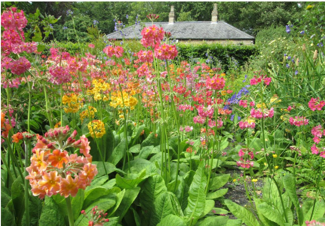
Springtime in a Swarland garden (sadly not the Editors')

The sessions are open to all members, and are very sociable as well as being a good learning opportunity (we always discover something new). If you are interested in joining a future session, please contact any committee member with your details.