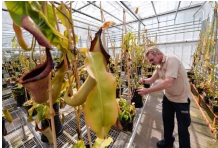
Nepenthes collection at Chester Zoo

This is a committee made up of members of the board, local group representatives, collection holders and experts, who monitor the conservation activities of Plant Heritage. They are responsible for the development of the conservation strategy, oversee the work of the conservation team and delivery of associated programmes and activities. A list of current members of this committee and the other committees that steer our work are in the About Us section of the website.