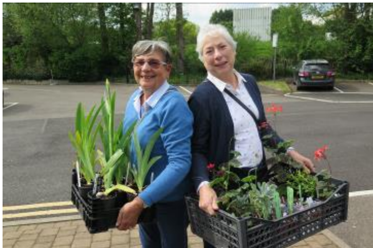
Delivering plants from members for our annual Plant Exchange

We recommend that plants from the Plant Exchange, as with all new plants for your collection are put into a 'quarantine' area for approx. 6 weeks to monitor plant health and possible pest or disease.