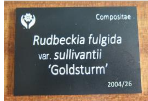
Engraved plant label

You must renew your membership of Plant Heritage each year.