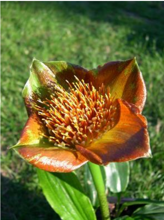
Scadoxus membranaceus ©Jonathan Hutchinson

The Nagoya Protocol guidance for National Collection Holders Convention on Biological Diversity CBD (1992)