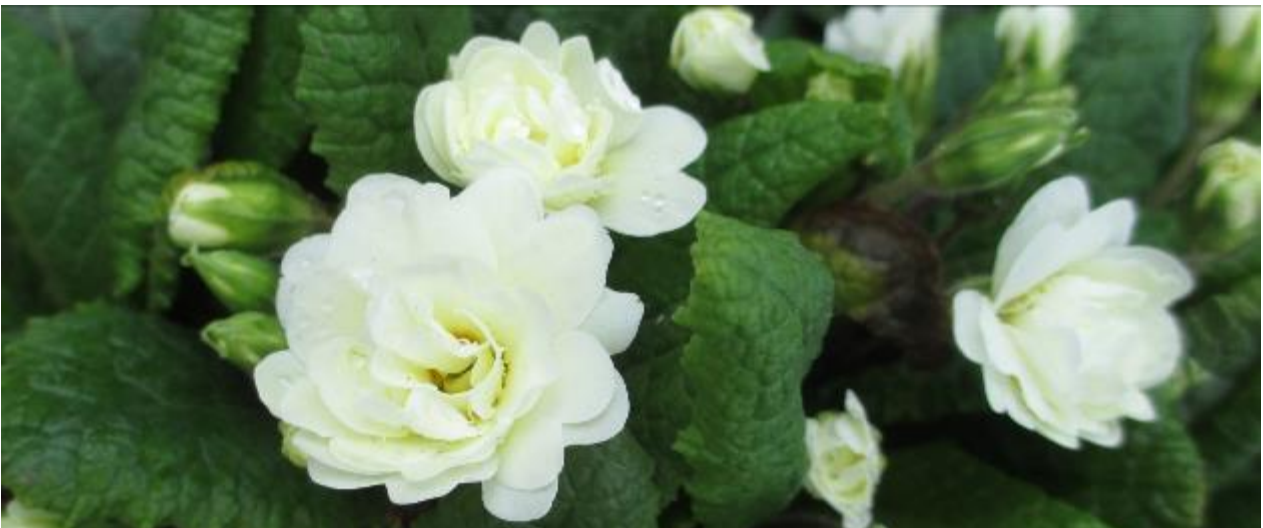
Primula 'Pridhamsleigh' from the collection of 'Double Primroses: Primula vulgaris ' in Cornwall

If you plan to make any changes to your collection such as from Provisional to Full status, a coordinator visit is necessary so they can write a short report before it goes to the Plant Collections Committee for approval.