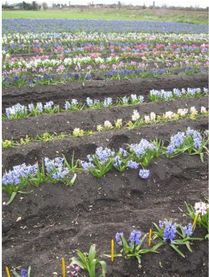
Collection of Hyacinthus orientalis held by Alan Shipp, Cambs